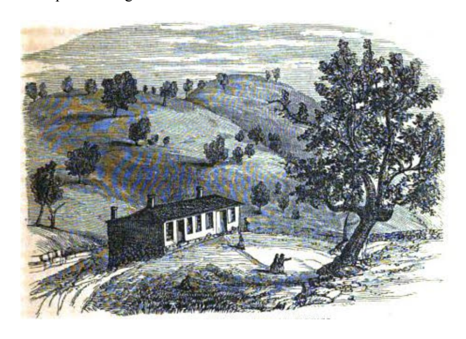
VIEW OF THE SOLANO MINERAL SPRINGS

The Congress Spring is but a short distance from the Empire, and very much resembles the latter, except that the escapement of gas is less.