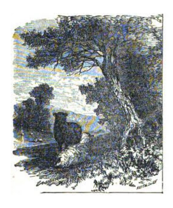
A SCENE IN THE FOOT HILLS OF SUISUN VALLEY.

The Seltzer Spring is on the west side of the divide, overlooking the upper portion of Suisun Valley. Its pellucid and sparkling waters are equal in taste to the best soda water ever drank, eclipsing, in flavor at least, the more celebrated Congress and Empire. Each of the Springs, with the exception of the White Sulphur, issue from the fissures of a light, porous, calcareous rock, of singular formation. These mineral waters have been known to, and even the resort of, native Californians, for more than twenty years, but they have received but little attention until recently; when the following careful analysis of two of the springs, by Dr. Hewston, of San Francisco, discovered the valuable medicinal properties they contained.